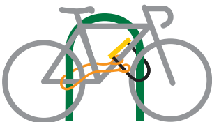
Adding a second lock allows both wheels to be secured.