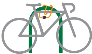
Inexpensive locks may be lightweight, but provide minimal security.