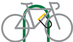
Always lock the frame and at least one wheel (front or back).